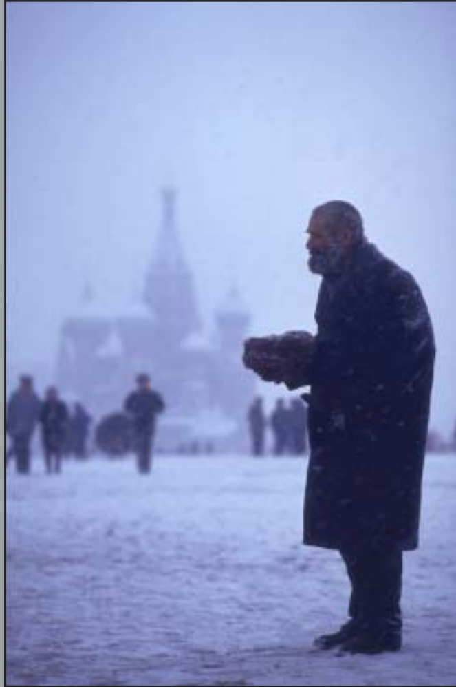
Red Square beggar