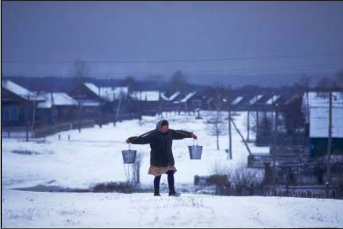
Electricity since 1920, but no running water