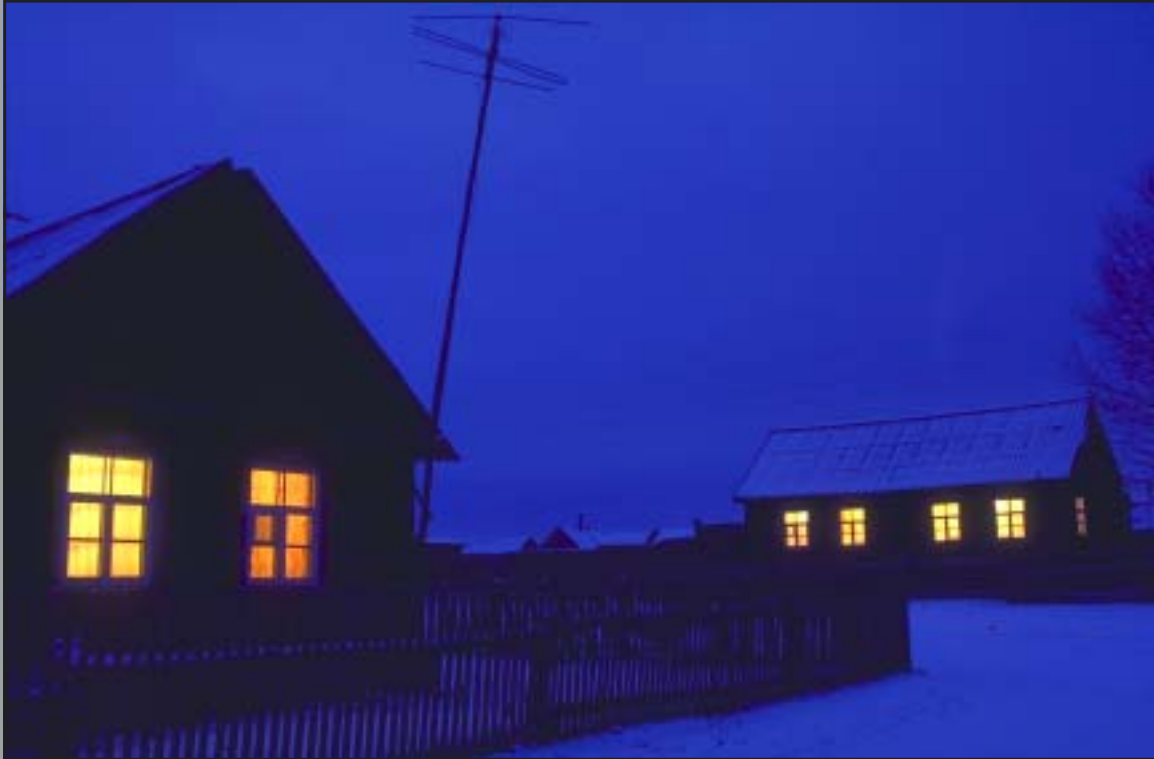
Lipovka, a tiny village 700 km. southeast of Moscow