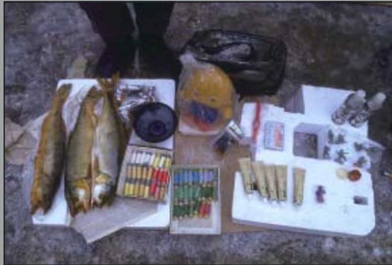
Moscovites buy and sell madly every day, sometimes as the only way to make a living.