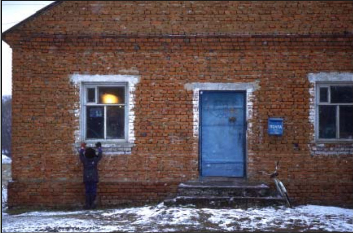
Lipovka post office