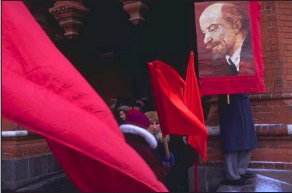
Pro-Communist demonstration at the Lenin Museum