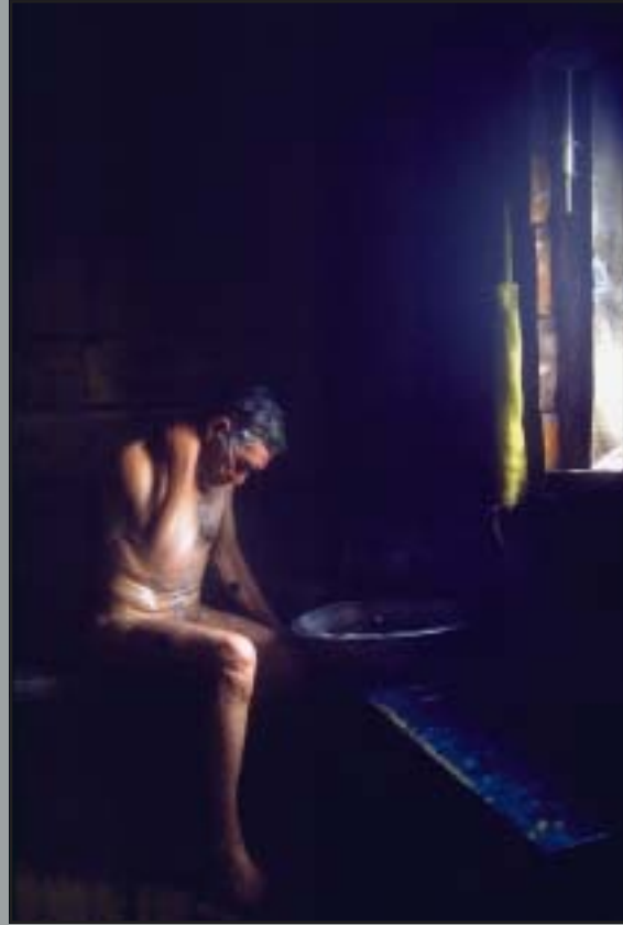
in the sauna