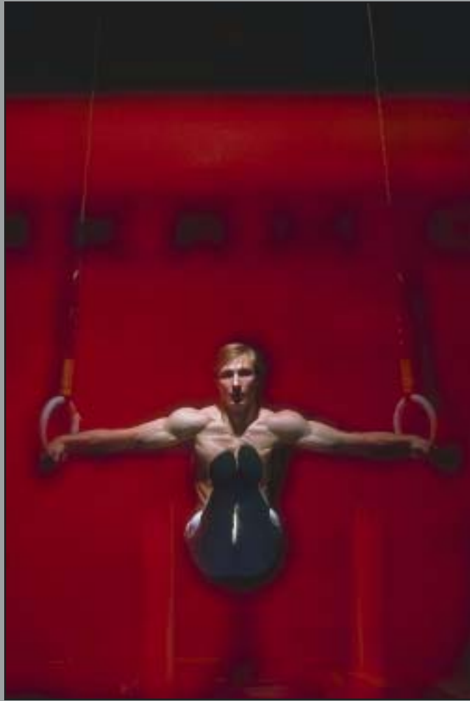
Olympic gymnast in training at Moscow's Dynamo sports center